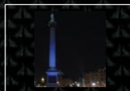
Nelson's Column · London