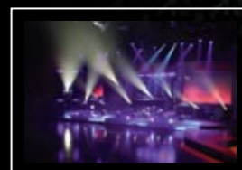
Jonathan Ross Show · London