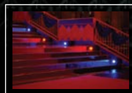
Red Carpet Launch · Tokyo