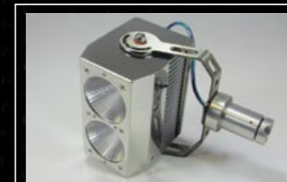
Warm White Head · SAT