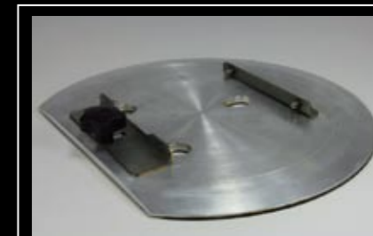
Floor Plate · SAT