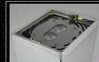
Grindle Cap · UL - HO - SAT