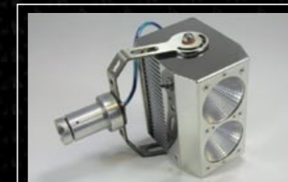
Cool White Head · SAT