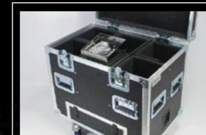
6 Way Charging Case · UL - HO