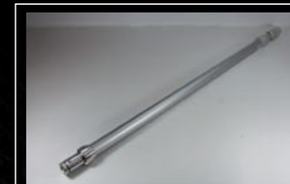
Extendable Pole · SAT