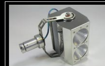
RGB Head · SAT