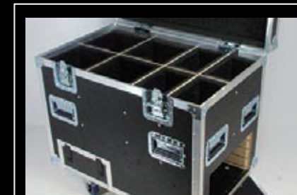
4 Way Charging Case · SAT