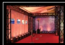
Breitling launch · New York