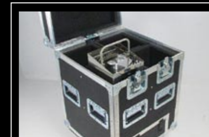
4 Way Charging Case · UL - HO